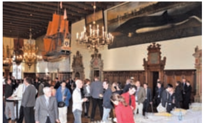
The upper hall of the Town Hall was richly decorated with model ships and paintings depicting the early days of Bremen as an important port and trading center. This served as the venue for our reception

On Wednesday evening a reception was held in the historic Rathaus Upper Hall of the Town Hall followed by a banquet in the Town Hall Cellar, a restaurant boasting the largest and oldest wine cellar in the region.