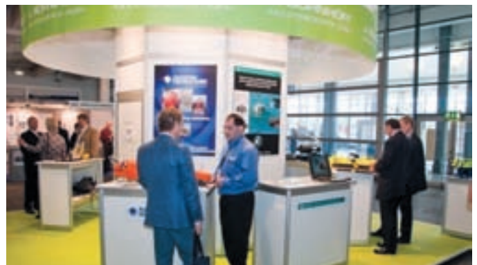
J. Bornhoft Industriegeräte GmbH