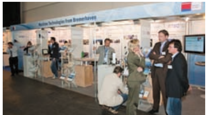
Maritime Technologies from Bremerhaven