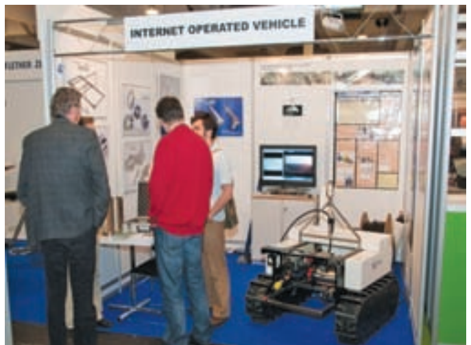
Internet Operated Vehicle