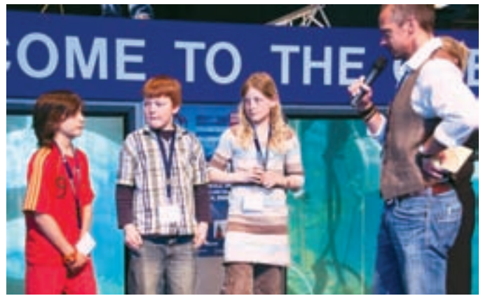
Ten year old robotics competitors being interviewed