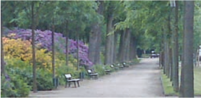
Bremen Park, a spacious open area with numerous walking trails, featured blooming rhododendrons of every color

free thinking that the residents are proud of today. The city has a rich and diverse cultural background making it a great place to visit. The pictures below document a few of the city sights enjoyed by those at the conference.