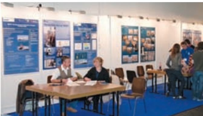
MARUM Centre for Maritime Environmental Sciences