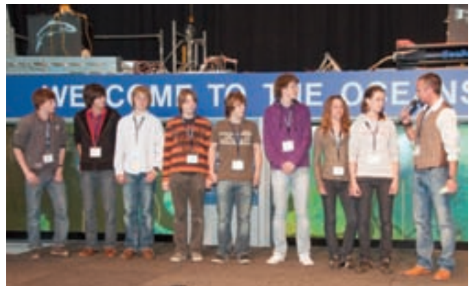
14–15 year old robotics competitors