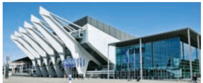
Bremen Congress Centre, site of the OCEANS '09 conference

Founded in 787 AD, Bremen is one of Germany's oldest cities. Bremen was once an independent city that played an important role in Germany's political and economic development. The city was known as a free market trade region and eventually became the seat of the Hanseatic League, a powerful trade organization. This legacy left Bremen with a tradition of independence and