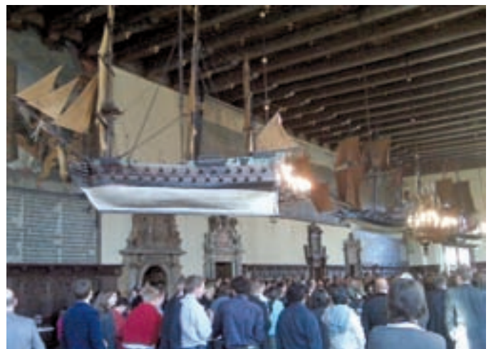
Model ships suspended from the rafters of the upper hall.