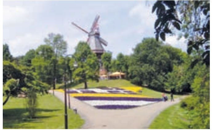
A windmill in one of Bremen's parks draws your attention with a serene beauty punctuated by bright colors