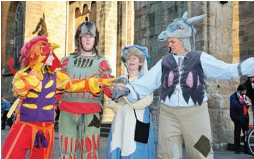
After the reception and on the way to the banquet we were treated to some local characters telling their version of the story of the Bremen town musicians