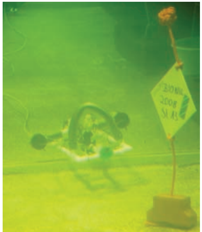
Competition robot in the tank