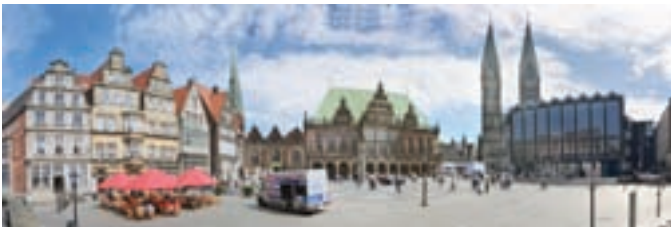
A panorama of the Bremen town square. Still a dynamic location in the center of commercial and government sectors