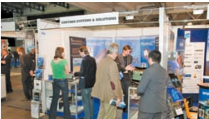
Contros Systems & Solutions