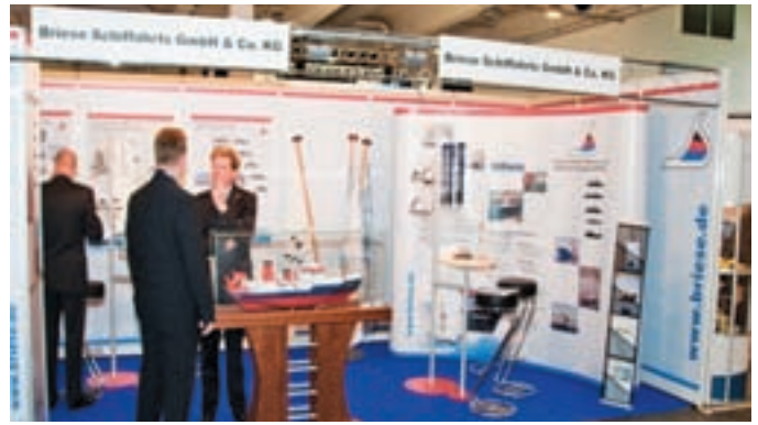
Briese Schifffahrts GmbH & Co. KG