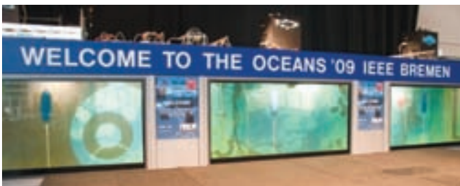
The aquarium was used for student ROV competitions as well as equipment demonstrations

A highlight of the exhibition was the 60,000 liter aquarium. It provided the opportunity for students and school kids to test self-designed underwater vehicles. A ROV student competition set a stimulus to attract young people into this vital field of sciences. Exhibitors also welcomed the additional attractions. As all coffee breaks and meals were served in the exhibition hall the exhibitors were pleased with the number of attendees. People are looking forward to the next OCEANS conference in Bremen.