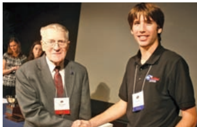
6th Place – La Jolla High School – San Diego, CA