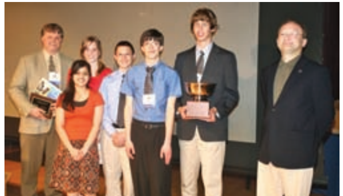
1st Place – Marshfield High School – Marshfield, WI

The balance of the awards were then presented in order: