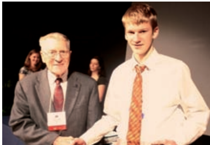
7th Place – Raleigh Charter High School – Raleigh, NC