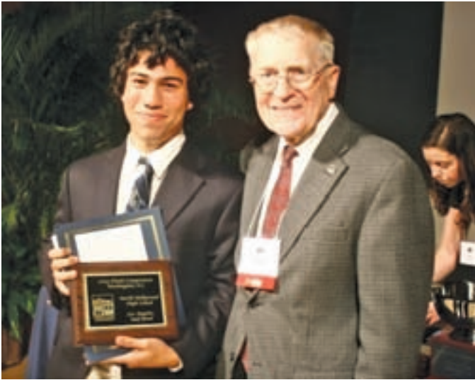
5th Place – North Hollywood High School – North Hollywood, CA