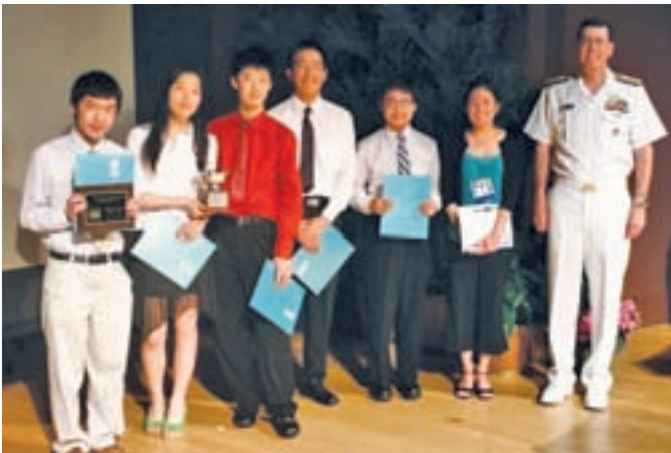
4th Place – Mission San Jose High School – Fremont, CA

The last award to be given was the Admiral James D. Watkins Award. It was instituted to recognize the team that best exemplifies the ideals of sportsmanship during the final competition of NOSB. The recipients of this award have been respectful to their team mates, fellow competitors, and the NOSB Volunteers and Staff. The winner of this award is selected by the student teams. The winner of the 2009 Watkins Award was Canterbury School of Florida. The team was called up on stage and Admiral Watkins came up and congratulated each member of the team. This was a fitting closing to an outstanding NOSB.