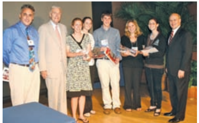
Admiral James D. Watkins Award – Canterbury School of Florida