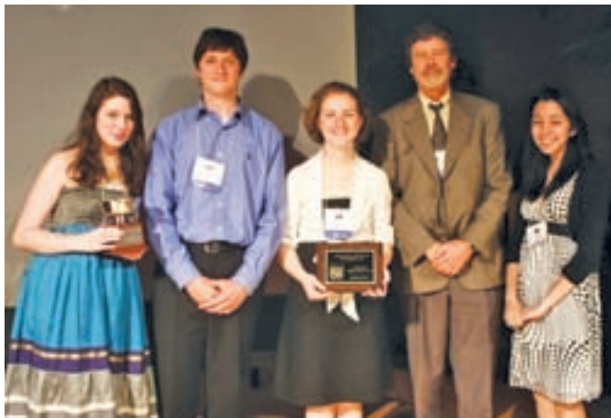
3rd Place – Cranston High School West – Cranston, RI

The last award to be given was the Admiral James D. Watkins Award. It was instituted to recognize the team that best exemplifies the ideals of sportsmanship during the final competition of NOSB. The recipients of this award have been respectful to their team mates, fellow competitors, and the NOSB Volunteers and Staff. The winner of this award is selected by the student teams. The winner of the 2009 Watkins Award was Canterbury School of Florida. The team was called up on stage and Admiral Watkins came up and congratulated each member of the team. This was a fitting closing to an outstanding NOSB.