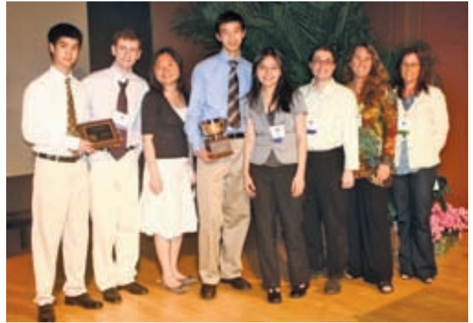
2nd Place – Lexington High School – Lexington, MA

The balance of the awards were then presented in order: