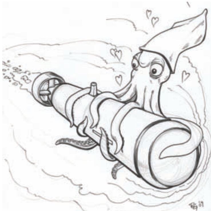
Artwork courtesy of Rob Gant www.robertgant.deviantart.com

Can you come up with a good caption for the cartoon below? Send your suggestions to the editor at j.gant@ieee.org .