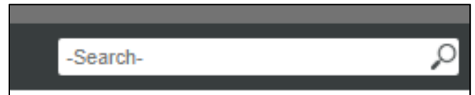
Search box on Help system

Enter key words in the Search field and click the Search (magnifying glass) icon to locate additional information.